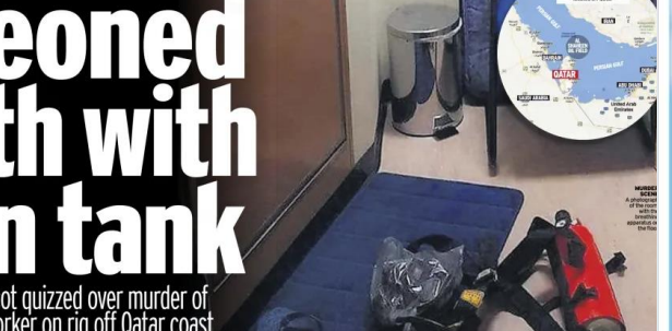
The location: The attack took place on the Seaflex Buri (inset top right).

The father of an offshore worker who was killed in a deadly attack in Qatar is back in Scotland. The man, who returned home after being held in Qatar, is now in Scotland. The man, who returned home after being held in Qatar, is now in Scotland. The man, who returned home after being held in Qatar, is now in Scotland. The man, who returned home after being held in Qatar, is now in Scotland.