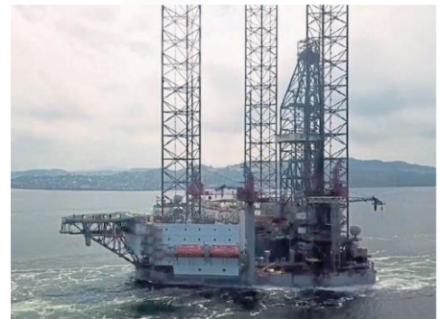
INQUIRY: Valaris was believed to be moving towards the shore as the incident occurred.

Goodwin on brink after Dons' worst night ever Diaboliical Reds are dumped out of Scottish Cup by Darvel. See Sport