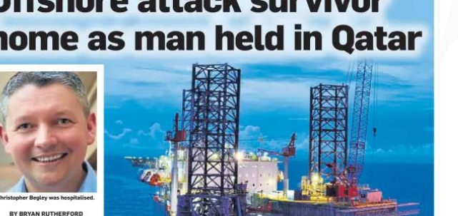
The location: The attack took place on the Seaflex Buri (inset top right).

The father of an offshore worker who was killed in a deadly attack in Qatar is back in Scotland. The man, who returned home after being held in Qatar, is now in Scotland. The man, who returned home after being held in Qatar, is now in Scotland. The man, who returned home after being held in Qatar, is now in Scotland. The man, who returned home after being held in Qatar, is now in Scotland.