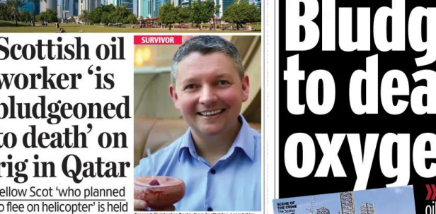
The location: The attack took place on the Seaflex Buri (inset top right).

The father of an offshore worker who was killed in a deadly attack in Qatar is back in Scotland. The man, who returned home after being held in Qatar, is now in Scotland. The man, who returned home after being held in Qatar, is now in Scotland. The man, who returned home after being held in Qatar, is now in Scotland. The man, who returned home after being held in Qatar, is now in Scotland.