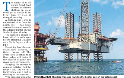
INVESTIGATION The dead man was found on the Seaflex Buri of the Qatar coast.