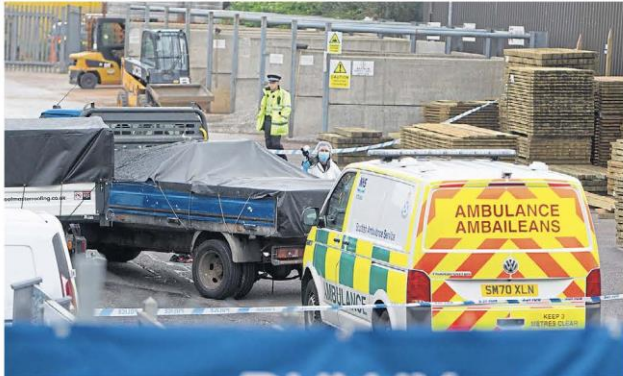
INVESTIGATION: Police officers guard the site as forensic staff in white suits gather evidence.